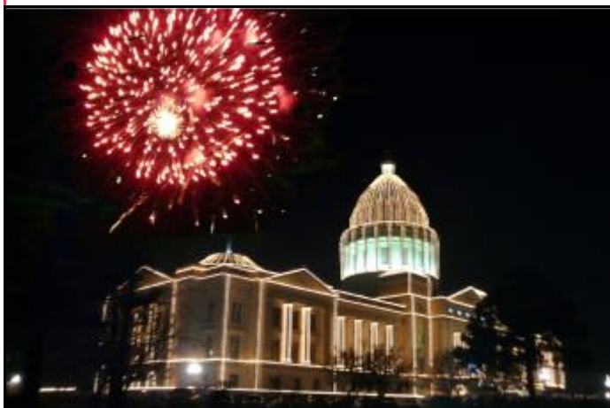
Fireworks and lighted capitol on December 6, 2008.