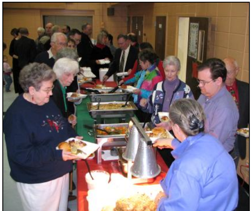
Some of the throng being served at the installation banquet. The meal was catered by Golden Corral.