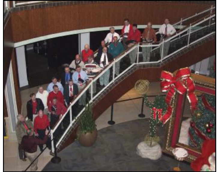
The Diamond State Chorus performing at Park Plaza in November.