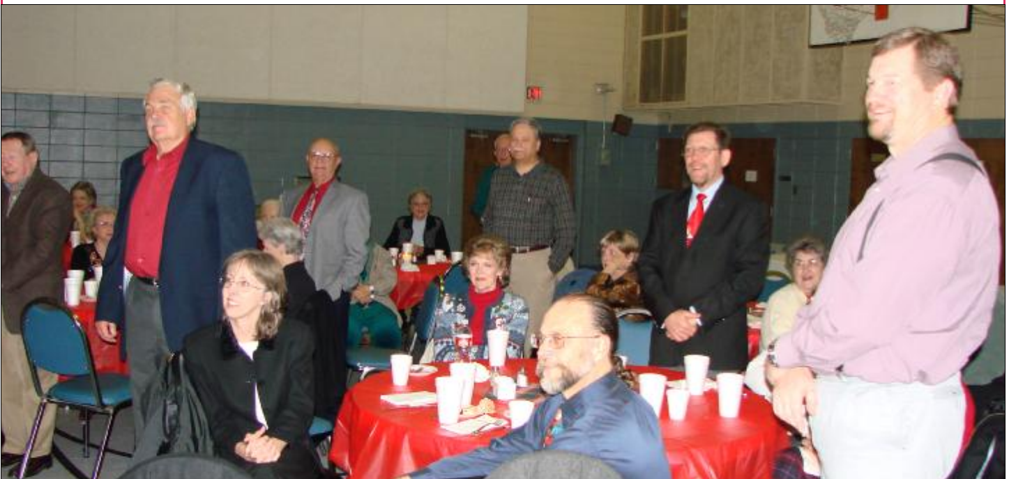
Members of the chapter standing to swear allegiance to the good of the chapter and to assist the officers in making 2008 a great year for barbershopping in Greater Little Rock.