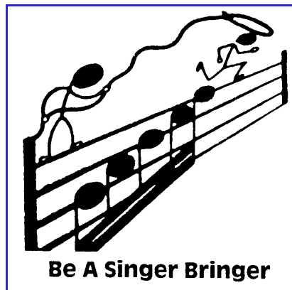
Be A Singer Bringer